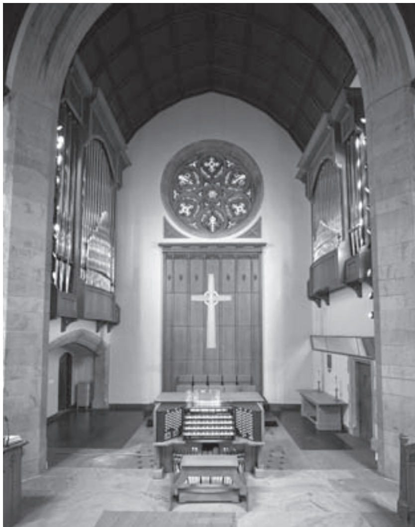
Konzelman organ, Larchmont Avenue Presbyterian Church