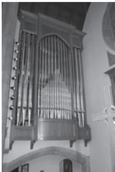
Left chancel case