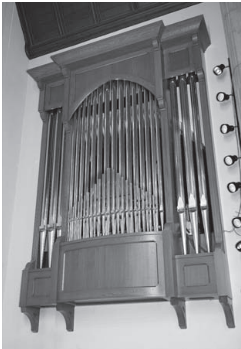
Right chancel case