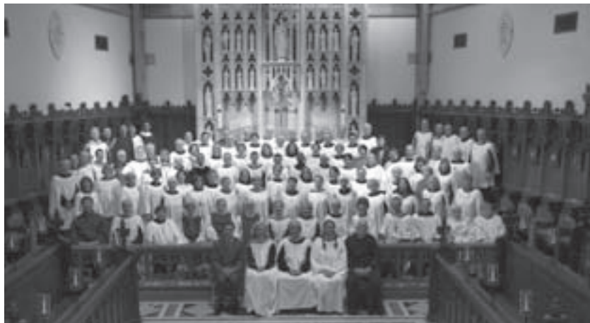
Conference attendees and faculty