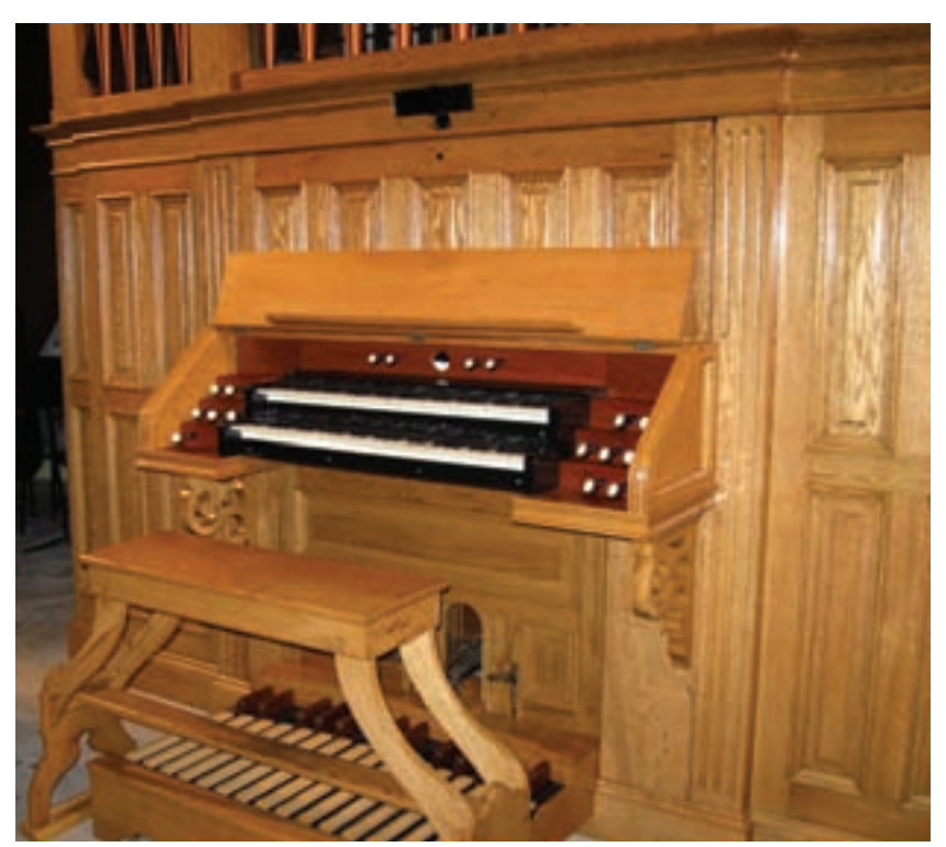
Felgemaker keydesk, St. Albert the Great Roman Catholic Church

The Keweenaw (the Copper Country) of Michigan's Upper Peninsula has seen a change in their functioning has seen a change in their functioning pipe organs. Since the catalog of the Keweenaw organs was published (THE DIAPASON, February 2007<sup>1</sup>), two of the organs have been dismantled and removed from the area. However, the Barckhoff organ (THE DIAPASON, October 2009<sup>2</sup>) added to the count, and the instrument the catalogue in the count, and one instrument, the ca. 1900 Felgemak-