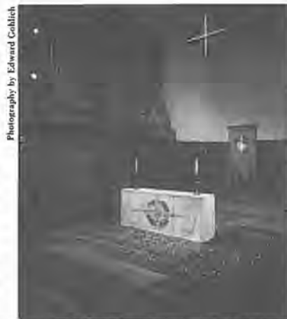
4-manual Aeolian-Skinner (1969) at St. Paul's Cathedral, San Diego