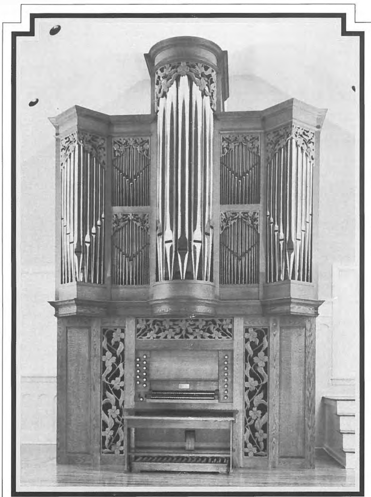
Hillsborough Reformed Church, Millstone, NJ Specification on page 10