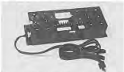
Peterson Console AC Control System

St. Paul's Episcopal, First Presbyterian, and the United Methodist churches, all located on Church Street, all within walking distance of each other, and all housing pipe organs built or rebuilt by Leonard Carlson, hosted the progressive recital. Sambach compared and contrasted each organ, and offered the audience a first-hand aural comparison by using the concluding selection of one program as the opening number on the next.