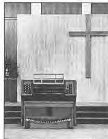
Chapel, First Presbyterian Church Allentown, Pennsylvania

The company that builds some of the largest organs in the world also builds some of the smallest. Every one is an Allen Organ. Let the world's largest builder of church organs meet your needs.