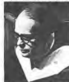
Mus. Doc., A.S.C.A.P.