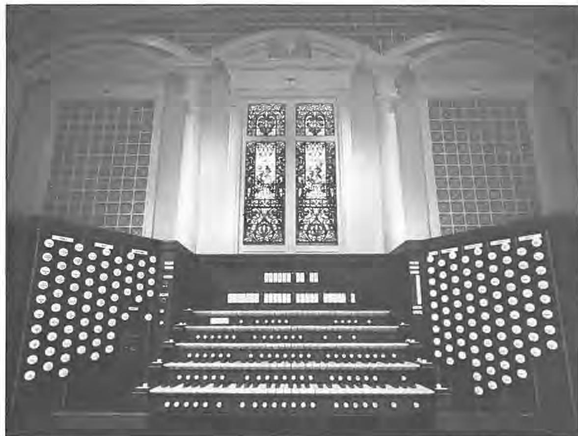
Johnson Ferry Baptist Church Marietta, Georgia