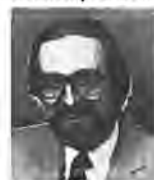
House Organist The Bushnell Memorial Hartford

First Church of Christ Wethersfield, Connecticut