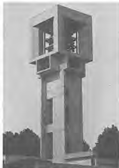
Metz Memorial Carillon, Indiana University