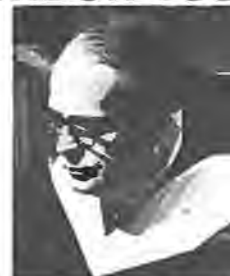
Mus. Doc., A.S.C.A.P.