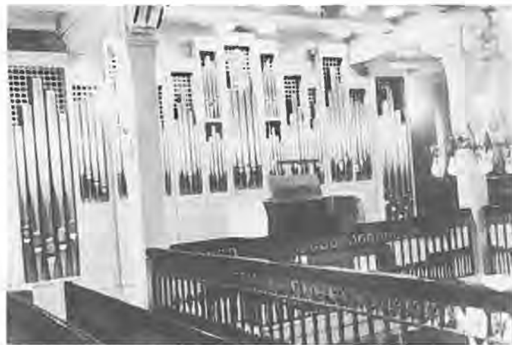
Domkirke, Reykjavik, Iceland