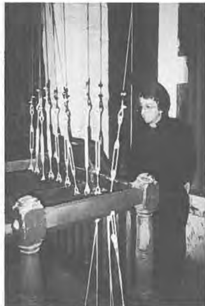
Thurlow Weed at the chimestand