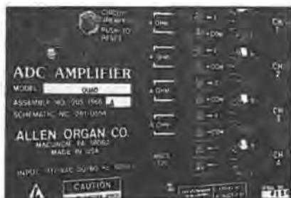
Allen Amplifier Assembly