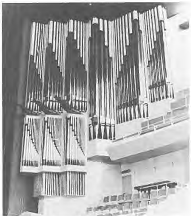
Cultural Center, Lyublana, Yugoslavia