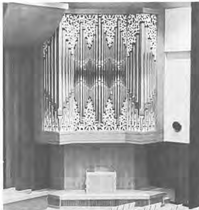
Myochi-kai Buddhist Temple, Tokyo, Japan