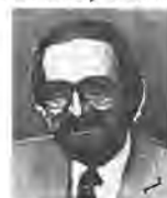
House Organist The Bushnell Memorial Hartford

First Church of Christ Wethersfield, Connecticut