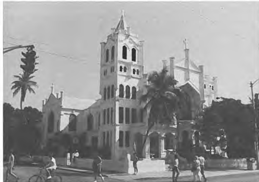
St. Paul's Episcopal Church, Key West