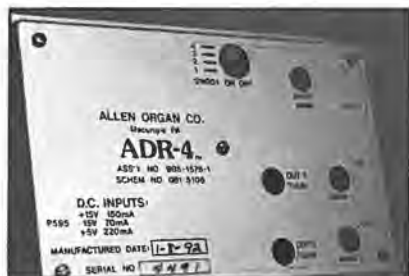
Allen Reverb Unit