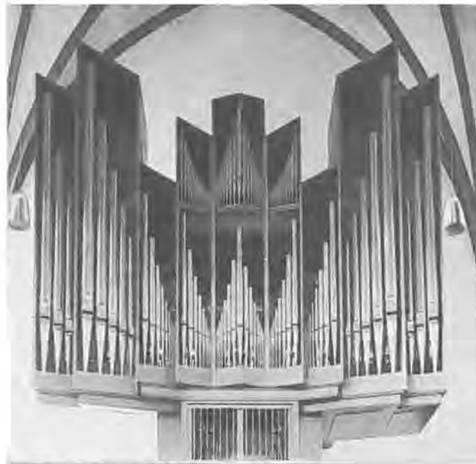
Dreikönigskirche, Frankfurt/Main, Germany