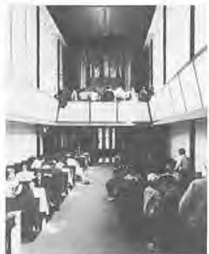
A Children's Pipe Organ Experience at St. Mark's on the Campus, Lincoln, NE

The Bedient Pipe Organ Company and the Lincoln (NE) AGO Chapter co-sponsored "A Children's Pipe Organ