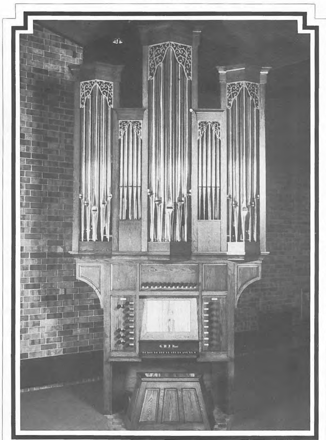
Shepherd of the Grove Lutheran Church, Maple Grove, MN Specification on page 10