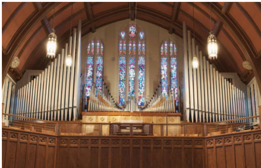
View of the organ case

Schoenstein & Co., Benicia, California First Lutheran Church, Sioux Falls, South Dakota