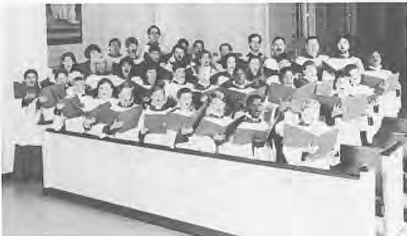
Memphis Boychoir and Memphis Chamber Choir