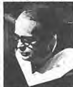
Mus. Doc., A.S.C.A.P.