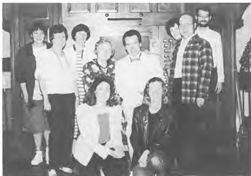
Participants in 14th Annual Institute of Church Music

The University of Michigan's 14th International Organ Institute and Church Music Institute were held July 6–17 in Ann Arbor.