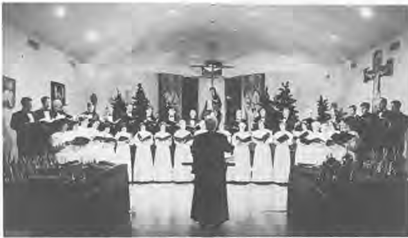
The Community of Jesus at Rock Harbor, Orleans, MA, presents the sixteenth annual English Carol Concert featuring the handbell choir, the children's choirs, and the chapel choir, Gloriae Dei Cantores . Two performances will be held on December 13 at 3:30 pm and 7:00 pm, with a formal Christmas Buffet Dinner at 5:30 pm. For reservations call 508/255-6204.