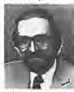
House Organist The Bushnell Memorial Hartford

First Church of Christ Wethersfield, Connecticut