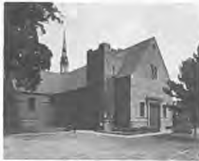
St. Therese R.C. Church