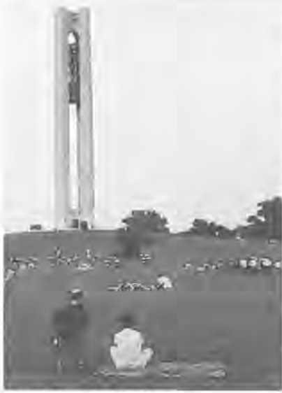
Deeds Carillon, Dayton OH