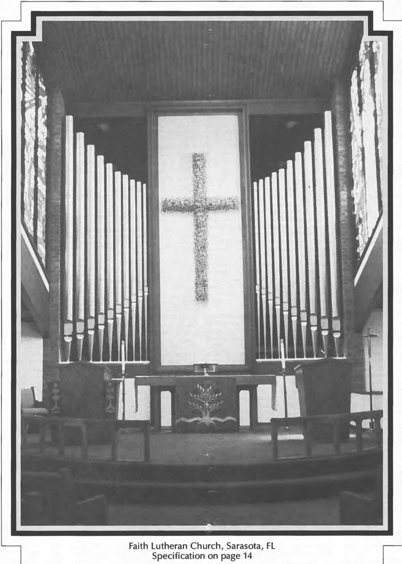
Faith Lutheran Church, Sarasota, FL Specification on page 14