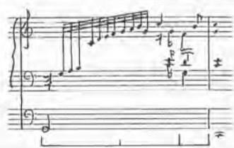
Example 5. BWV 564 (Fugue), m. 134.

The emphasis is on the V7 quarter-note chord; this emphasis is made even stronger by the trills. Added passage work would obscure the rhythmic shift in this measure. Bach often uses hemiolas at important cadential points; measure 286 of the Passacaglia in C Minor is another example of that technique. By altering the rhythmic emphasis in measure 134 of the work under discussion, Bach is calling attention to a very important event in the piece, namely, the final perfect authentic cadence.