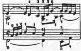
Example 6. Praeludium , m. 4.