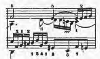
Example 16. Praeludium , m. 8.