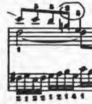
Example 9. Fughetta , m. 10.