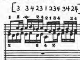
Example 15. Fughetta , m. 18.