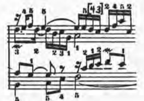
Example 12. Praeludium , m. 15.