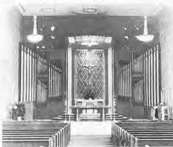
SAINT JOSEPH CHURCH Needham, Massachusetts