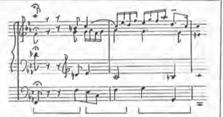
Example 6. BWV 582, m. 285-286.