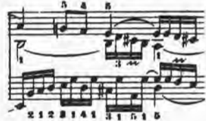
Example 6. Praeludium , m. 4.