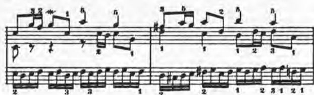
Example 4. Fughetta , mm. 7-8

For maximum flexibility in changing position and to preserve a closed hand, it appears that, as far as possible, every finger should be able to cross its neighbor or to slide beneath it. The thumb, of course, is the foundation for pivoting in 20th-century keyboard technique and its use in this capacity is part of earlier techniques as well. Nonetheless, the