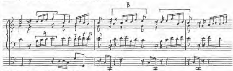
Example 3. BWV 564 (Toccatà), m. 75-77.