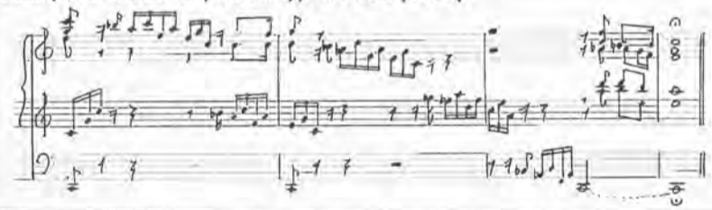
Example 4. BWV 564 (Toccatà), m. 81-84 (coda).

interrupt it in measure 82 and start again an octave lower, followed by two more statements of that same figure, each time an octave lower until it reaches the lowest note on the pedals. This descent to the low range of the instrument, coupled with the restatements of the broken third figure, produces an effect of added weight. This effect is strengthened by the final cadence, which brings the toccata to a powerful close with its full five- and six-voiced texture. The embellishment of this coda with a flurry of thirty-second-note divisions and a "cadenza," as Soderlund suggests 17 would enervate this passage and cause confusion just prior to the final cadence by injecting elements which were not present anywhere else in the movement.