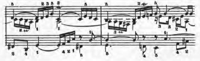
Example 14. Praeludium , mm. 6-7.