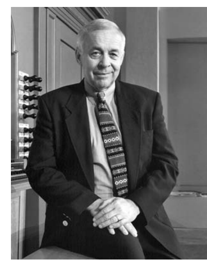
At Arizona State University

We have reached a new level of understanding of articulation in terms of