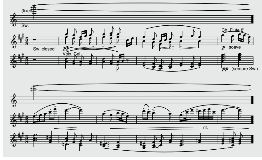
Example 4. Resonet in Laudibus, op. 106, no. 3