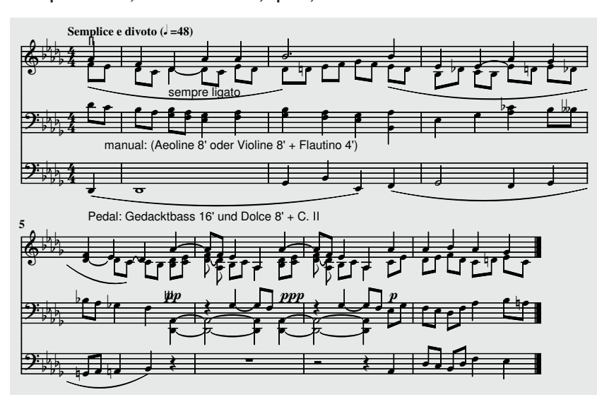
Example 2. O Gott, du Frommer Gott, op. 65, no. 50

The registrations call for a three-manual organ; however, with judicious use of pistons, a well-equipped two-manual organ would serve equally well. This piece is only moderately difficult but highly effective (see Example 3).