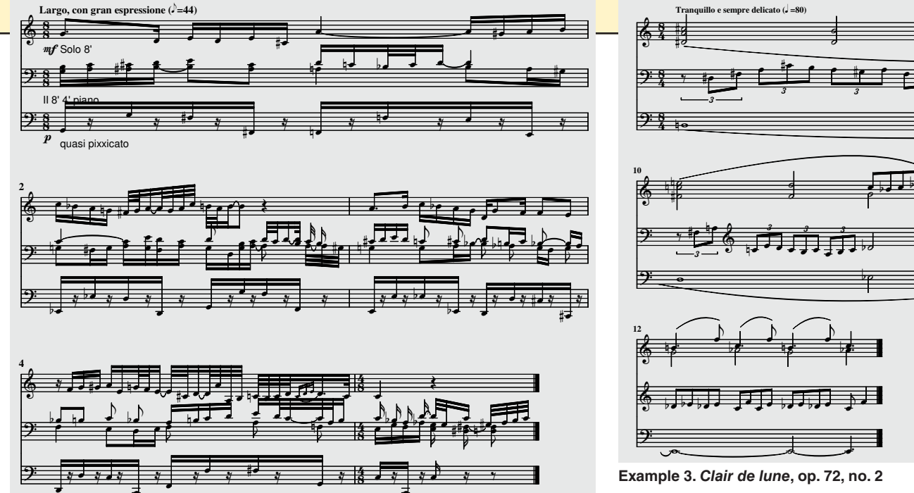
Example 1. Jesus, meine Zuversicht, op. 78, no. 10