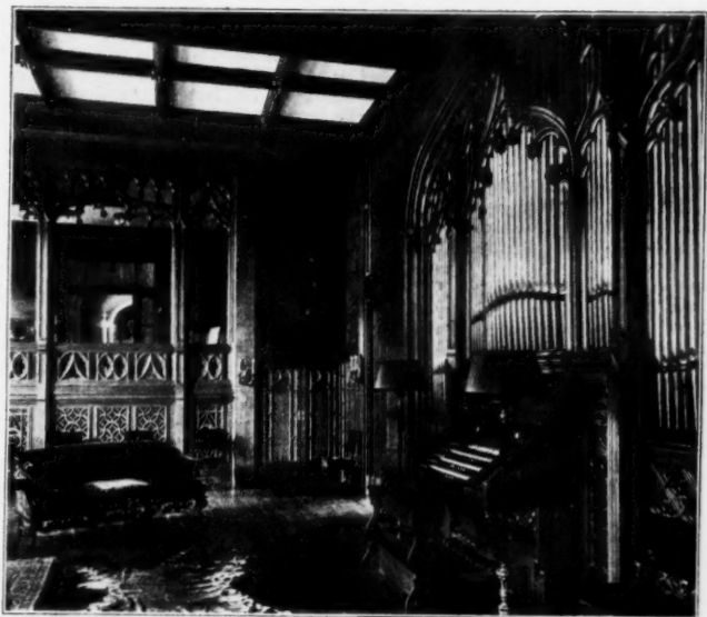
ORGAN IN HOME AT FRANKFORT, KY.