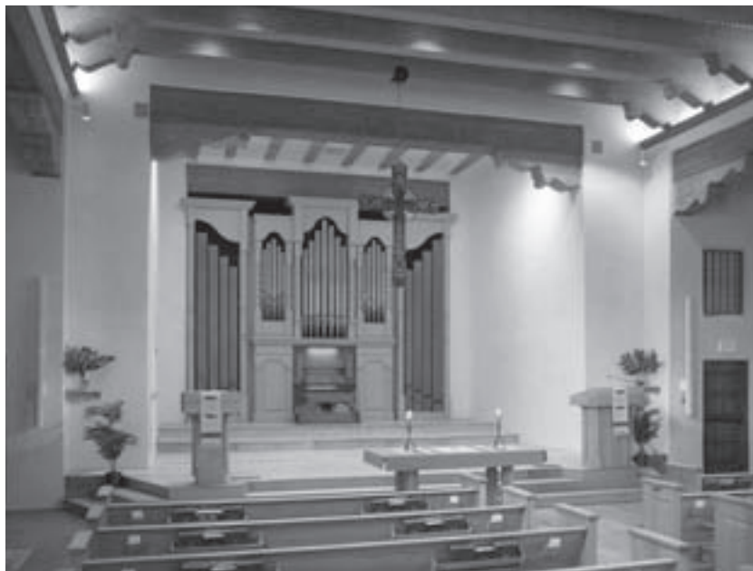
Finished installation of Opus 133 in the sanctuary designed by John Gaw Meem in 1937