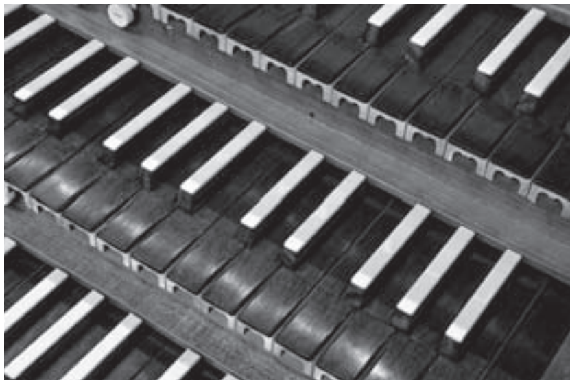
Keyboards with grenadilla naturals and rosewood sharps capped with bone

consulted closely with us over a period of several years. The final stoplist is the result of careful research and thoughtful discussion in many areas of importance—the musical requirements of the Presbyterian liturgy, including leadership and accompaniment, the acoustics of the church, and the breadth and flexibility needed in a recital instrument.