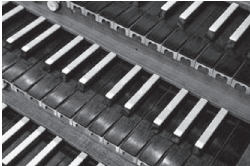
Keyboards with grenadilla naturals and rosewood sharps capped with bone

consulted closely with us over a period of several years. The final stoplist is the result of careful research and thoughtful discussion in many areas of importance—the musical requirements of the Presbyterian liturgy, including leadership and accompaniment, the acoustics of the church, and the breadth and flexibility needed in a recital instrument.