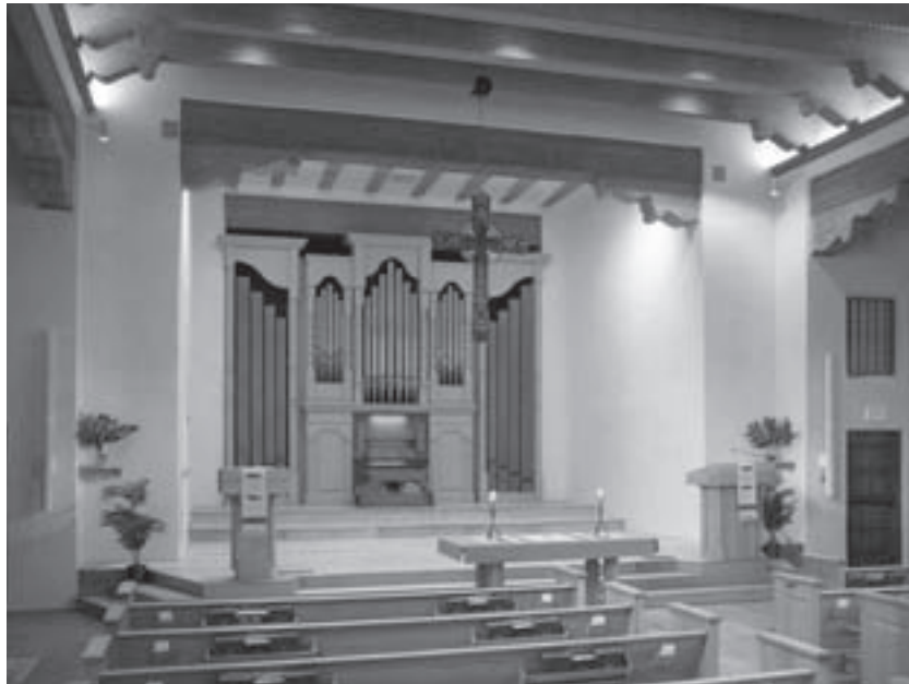
Finished installation of Opus 133 in the sanctuary designed by John Gaw Meem in 1937