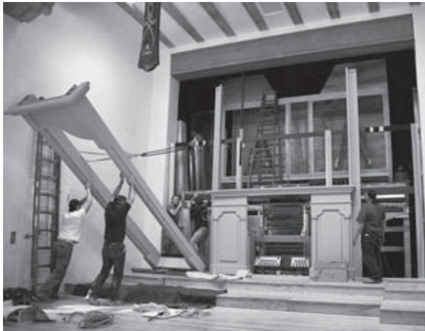
Raising the CC side pedal tower