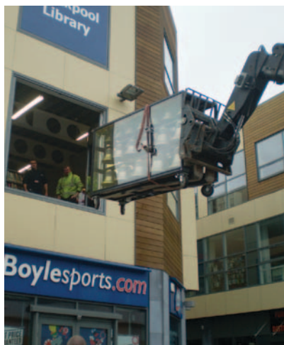
Carillon being hoisted into library