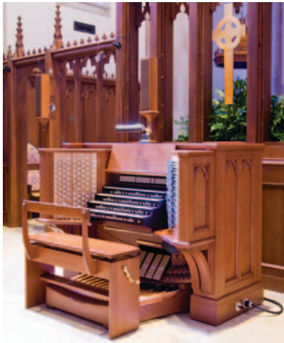
Schoenstein console, Cathedral of St. Philip, Atlanta, Georgia

includes the most advanced playing aids and a layout of stops and controls that promotes efficiency and ease of performance. Console mobility is another important factor. Also, provision has been made to accommodate the addition of a large Antiphonal organ in the west gallery at some point.