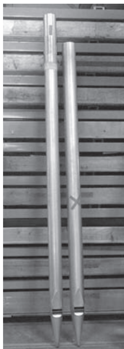
Principal into Gamba

The console is placed in a fixed central position in the choir loft to provide the organist with space for conducting both choir and instrumentalists.