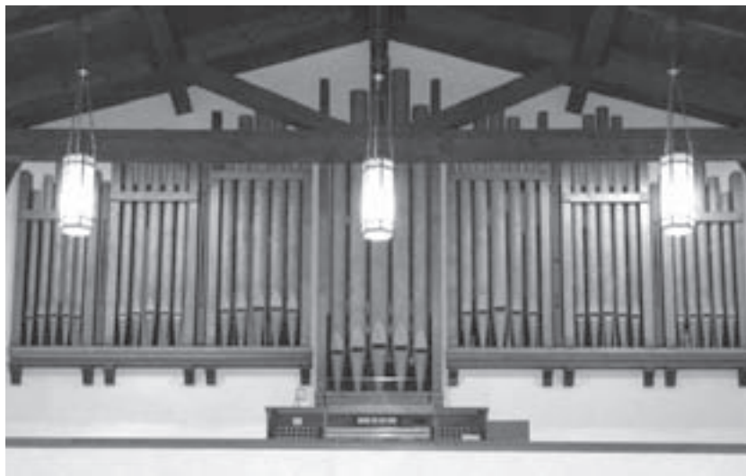
Hupalo & Repasky, Zion Lutheran Church, Piedmont, California

Our concerns were to provide the church with a tonally versatile and cohesive musical instrument, which would have a visual presence in the room, and would be reliable and serviceable. Using many ranks from Möller's opus 5769 and opus 7370, the original conception for Zion's new pipe organ envisioned a three-manual organ of forty ranks. This